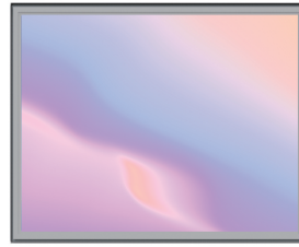
Resistive Touch Photo